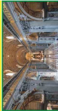
Inside The Vatican