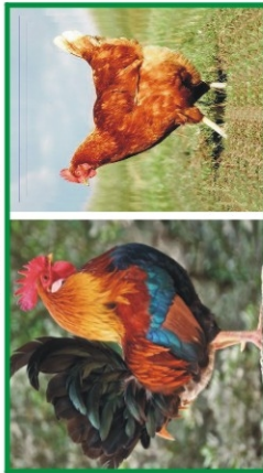
Rooster & Hen