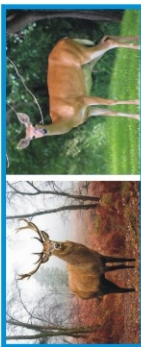
Buck & Doe (Deer)