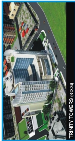
TRINITY TOWERS (RCCG)