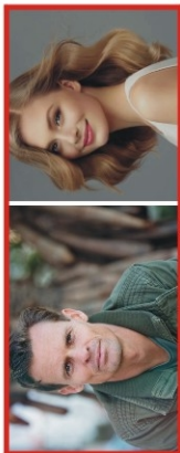
Man & Woman