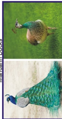
Peacock & Peahen