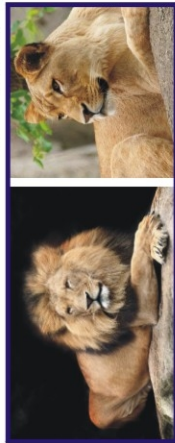
Lion & Lioness